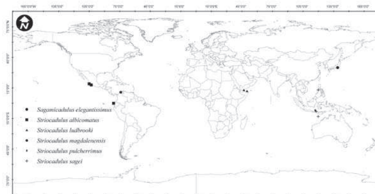
Figure 1. Geographic distribution of the genera Striocardulus and Sagamicadulus around the world, following Scarabino (1995), Rios-Jara et al. (2003a) and Steiner and Kabat (2004).

Among the eight genera within Gadilidae (Steiner and Kabat, 2001), Striocardulus Emerson, 1962 is represented by very few species compared to other genera in the family. The genus is very distinct and is comprised by species living in moderately deep waters in tropical oceans that are characterized by having medium to large curved shells, sculptured with numerous longitudinal striae. According to Scarabino (1995) and Steiner and Kabat (2001, 2004), the genus currently consists of four living species with well delineated ranges. Striocardulus albicomatus (Dall, 1890) occurs along the west coast of North and Central America at depths of 41-730 m; S. ludbrookii Scarabino, 1995 is distributed in the northern Indian Ocean at 528-732 m; S. pulcherrimus (Boissevain, 1906) has been recorded from Indonesia at 530-694 m, and S. sagei Scarabino, 1995 from the Philippines and Indonesia at 640-800 m (Figure 1). Herein we describe a new species recently collected on soft substrates of the upper slope off the Colombian Caribbean coast in two deep-sea trawled samples taken by the R/V Ancón in 1998, during the cruise INVEMAR-MACROFAUNA I (Figure 1). Shells were examined, and photographed under Scanning Electron Microscopy (SEM) (Leica Stereoscan 440 W and Amray 1810 SEM's). Material examined was deposited at the Museo de Historia Natural Marina de Colombia (MHNMC), Santa Marta, Colombia.