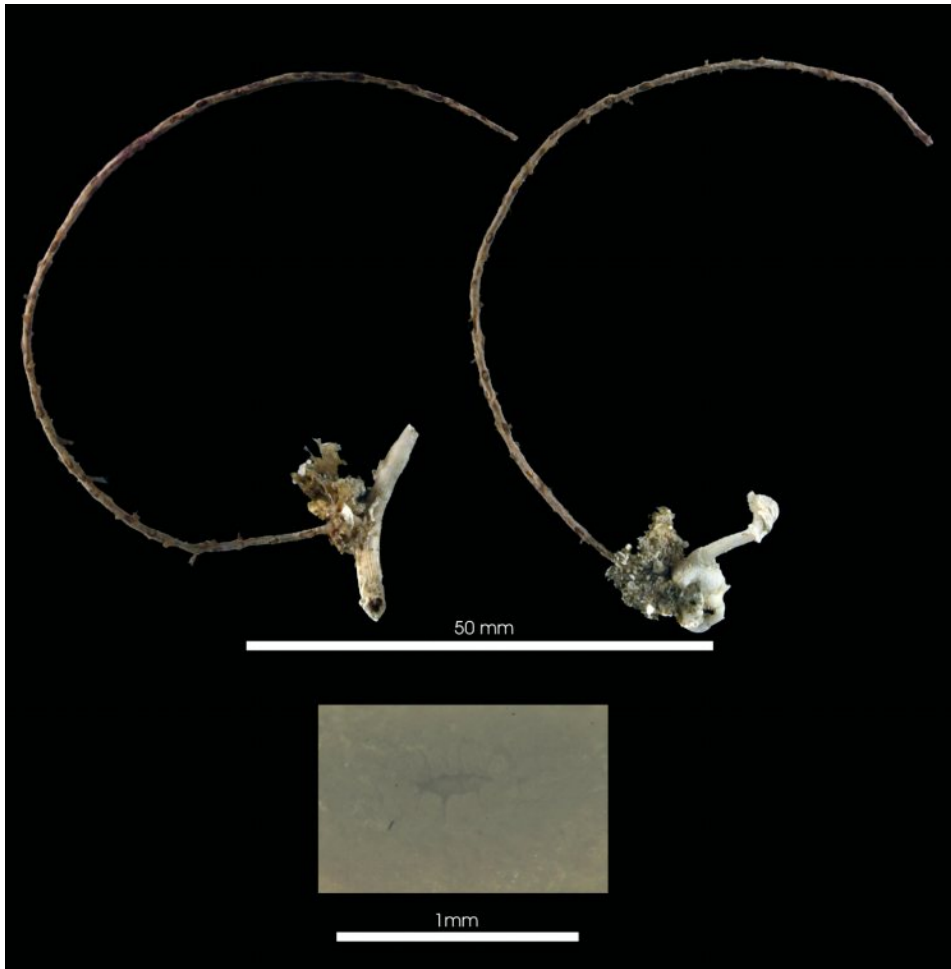
Figure 2. Colonies (above) and polyp aperture (below).

different methods to collect the samples and the higher depths where they were found in Colombia, may cause this color variation. According to Sánchez (2007), the live colonies color is yellow. But according to specialists who collected the samples of this study they were brightly orange when collected. Color can not be a diagnostic character and therefore this difference was not used as a reason to separate the samples from the species described by Sánchez (2007).