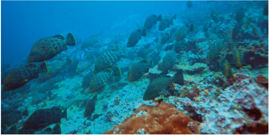
Figure 3. A large aggregation of nuclear-follower species moving close to coral reefs at 10 m depth at Malpelo Island in search of new hunting sites.

Hypotheses about the benefits and costs of the nuclear-follower feeding associations vary. A general view is that the follower species benefit by enhancing prey detection and by gaining easier access to prey types that would otherwise be unavailable (Spotte, 1996; Lukoschek and McCormick, 2000; Sazima et al. , 2007). Additionally, fishes involved in the association benefit from increased protection against predators (Roberts, 1996). From these two viewpoints, the nuclear-follower association could be described as an instance of commensalism, since the follower species benefits from the association while the nuclear species is not affected (Aronson and Sanderson, 1987; Lukoschek and McCormick, 2000). However, in some instances the nuclear species may be at a disadvantage due to competition for food, in which case the interaction could be described as a form of “parasitism” (Lukoschek and McCormick, 2000). The hypotheses are not mutually exclusive and, thus, more than one explanation applies to account for the benefits and/or disadvantages of different types of multispecies foraging associations (Krebs, 1973).